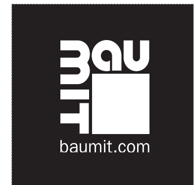
Single color use